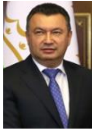
H.E. Mr. Qohir Rasulzoda, Prime Minister of the Republic of Tajikistan