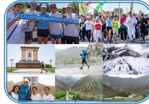
#RUNBLUE Global Water Marathon

Eleven side-events on different aspects of the water issues