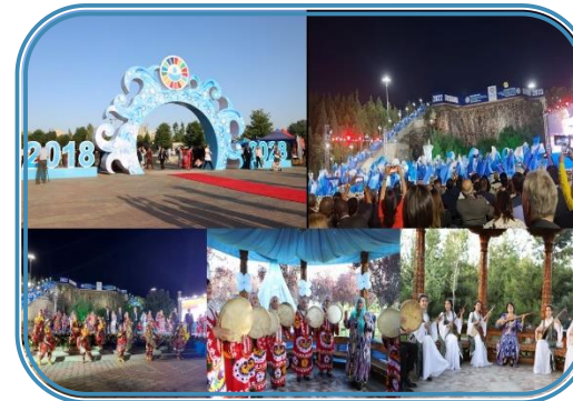
Dushanbe Water Festival